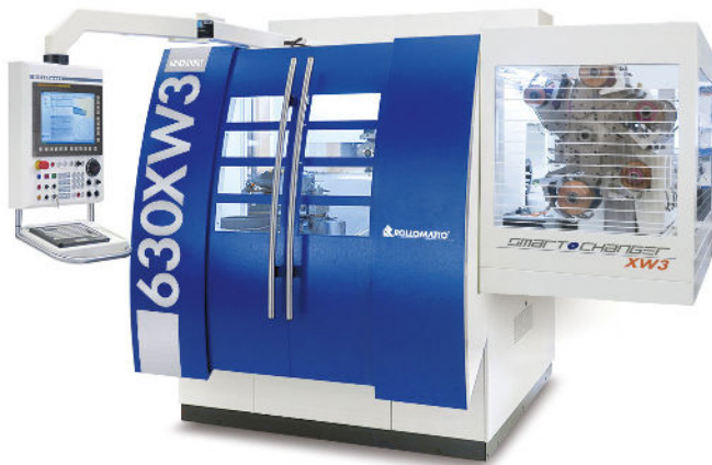
GrindSmart® 6-axis tool grinding machine with 16-station wheel and nozzle changer

Mundelein, April 2021. Rollomatic, a leading machine tool manufacturer based in Le Landeron, Switzerland, maintains its global leadership position in the field of 6-axis CNC tool grinding by highlighting the model 630XW3 with a 16-station wheel changer. This model is part of the GrindSmart® series of tool & cutter grinding machines with an axis configuration that incorporate 6 fully interpolated axes (3 rotary and 3 linear) and is unique in this industry. The machine also incorporate linear axis drive technology.